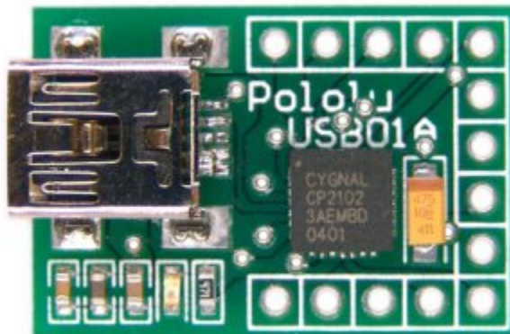
Pololu USB-to-serial adapter with CP2102

We use the Silicon Labs [ http://www.silabs.com/ ] CP2102 USB-to-UART Bridge Controller in several of our products to provide USB connectivity while communicating via a simple serial protocol. It is the key component of our Pololu USB-to-serial adapter [ http://www.pololu.com/catalog/product/391 ]: